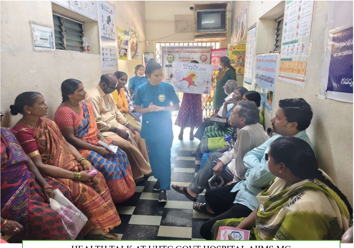
HEALTH TALK AT UHTC GOVT HOSPITAL AIIMS MG