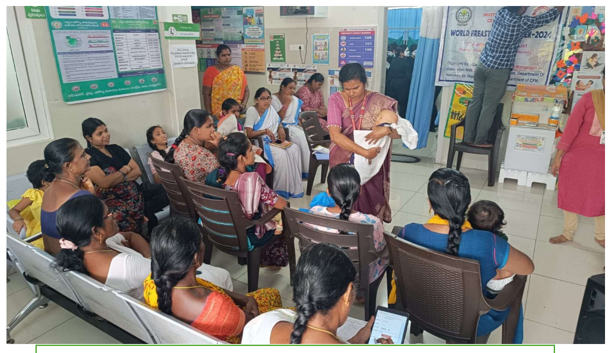
HANDS ON TRAINING AT UHTC AIIMS MANGALAGIRI