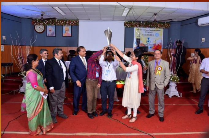
Winners of Cerebration 1st Colloquium 2019- AIIMS Mangalagiri