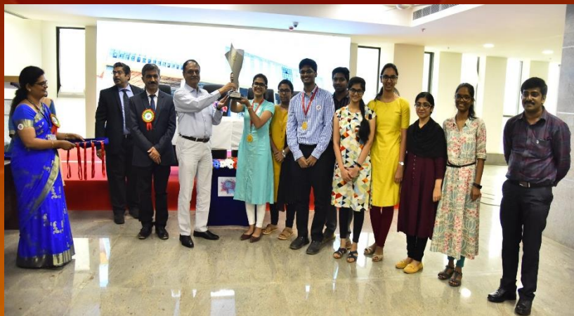
Winners of Cerebration 2nd Colloquium 2020 - Rangaraya medical College, Kakinada