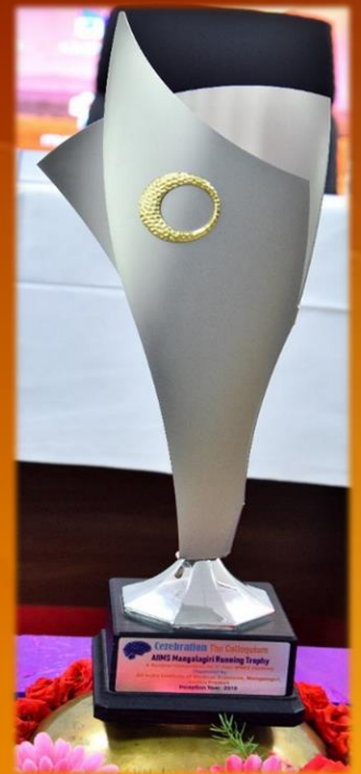
AIIMS Mangalagiri Running Trophy