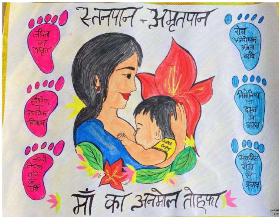
First prize winning poster in e-poster competition under Nursing Stream