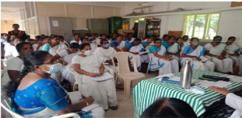
Community Health education sessions conducted by Dept of CFM