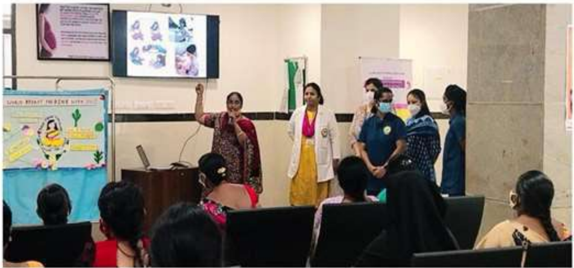
Health education sessions by Faculty from Dept of Obstetrics and Gynecology