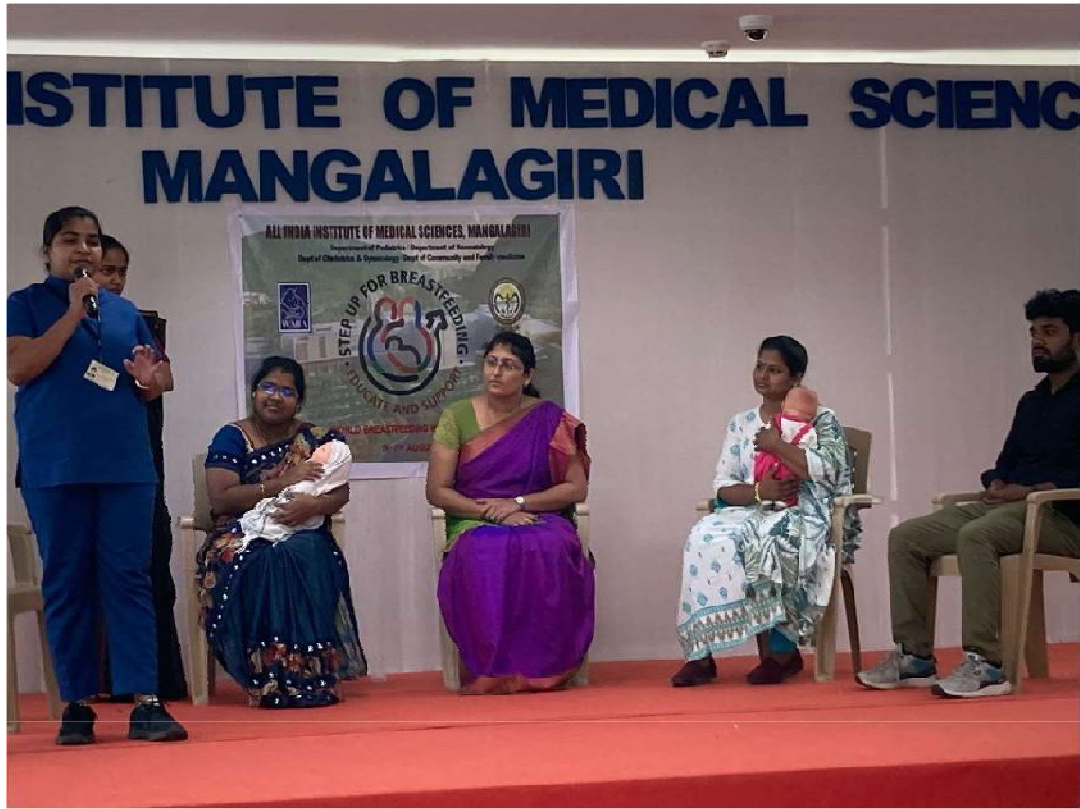
Role play by nursing officers